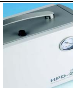
Optional regulating valve